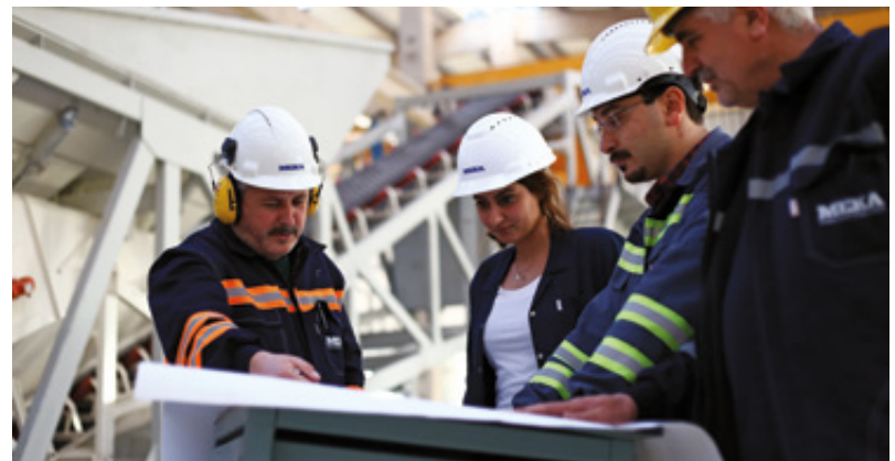
Scenes from MEKA Factories